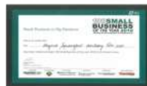
100 Small & Big Business of the Year 2010