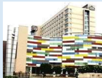
HBN Town Centre Sunrise City 1,00,000 sq. ft. Bathinda, Punjab