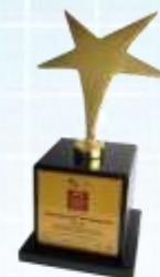
Most Admired Shopping Centre Management Company of the year 2016