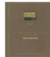
Most Admired Shopping Centre Management Company of the Year 2012 – Finalist