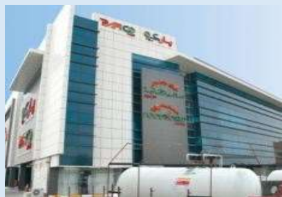
Parco Mall 3,50,000 sq. ft. Doha, Qatar