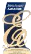
Best Shopping Mall Advisory Company 2014