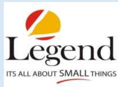
Legend Broadway 1,70,869 sq. ft. Hyderabad, Telangana