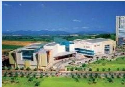
Lulu International Shopping Mall 16,00,000 sq. ft. Cochin, Kerala