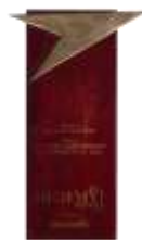
Nomination in Remmy Awards 2010 for the "Best in Service Industry"